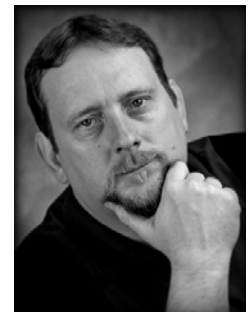
© 2007 Main Street Photography & Events

Submit your articles, ideas, tips & tricks, etc. to scott@mainstphotoevents.com . Some submissions may be edited for content, space, etc.