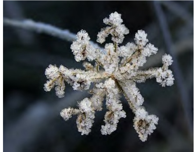
Queen Anne's Ice