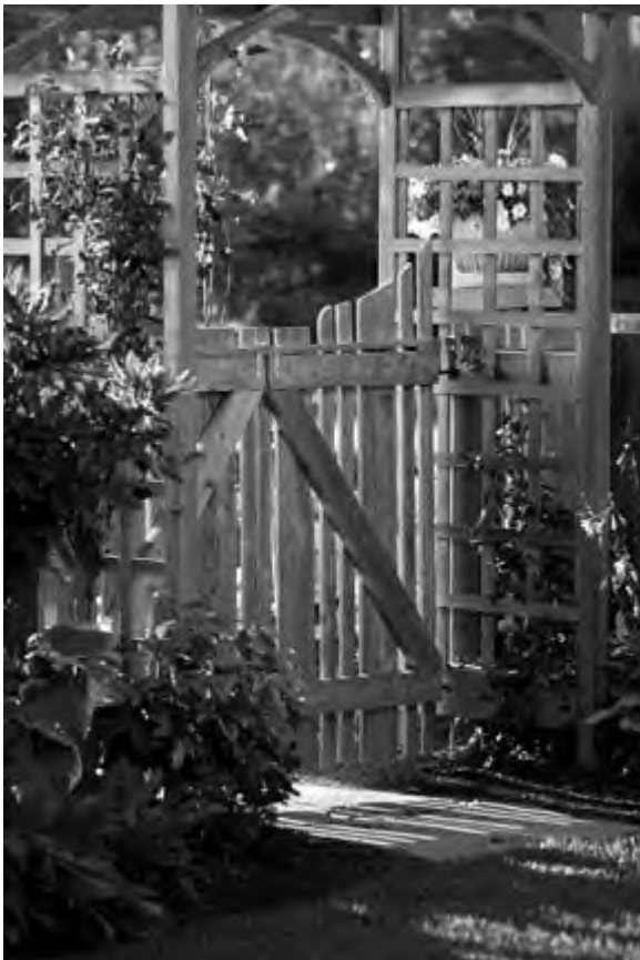
Garden of Light by Krista Beckner