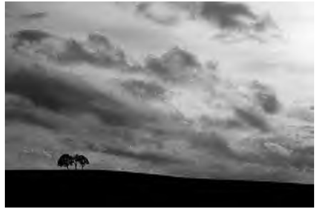
Isolation by Debbie Vorhees