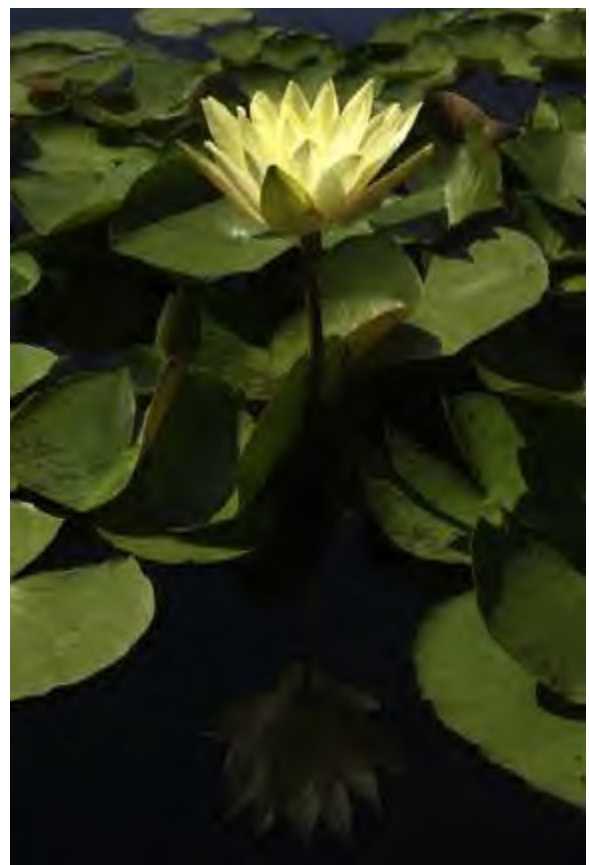
Water Reflection by Ed Eisenberger